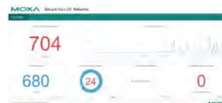
Security Dashboard Console Security Management Software