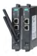
Moxa Remote Connect Suite Secure Remote Access