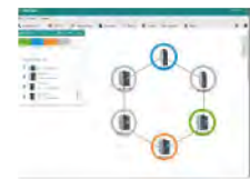
MXview Series Industrial Network Management Software