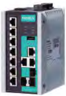
EDS E Series Industrial Ethernet Switches

Building reliable and secure networks to maintain your business operations