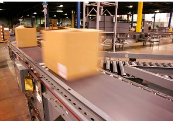
Fast processors due to short response times.