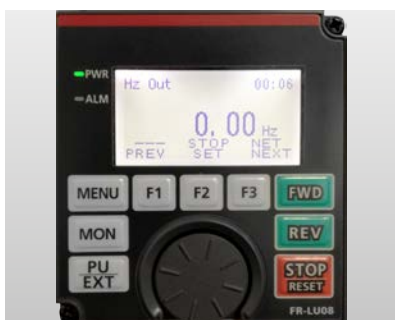
FR-LU08 as full text display with up to fifteen language and real time clock.

The operation panel with the one touch Digital Dial allows direct access to all