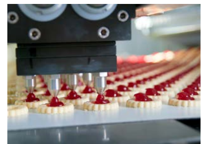
Positioning is one out of many scopes.

By using the built-in absolute positioning function and the built-in high level PLC function, a complete machine can be managed by a stand alone drive. Sensorless positioning is possible with IPM Motors.