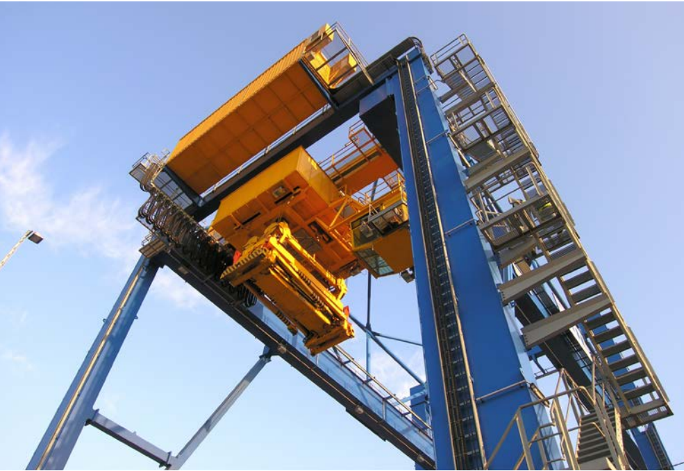
Perfect for crane applications due to built-in 100 % ED Break chopper up to 55 k